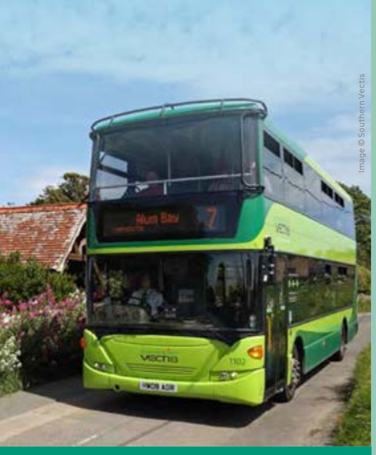
Disclaimer: All information is believed to be correct at the time of going to print, however we strongly recommend you check details of bus times, routes and attraction opening times before travelling.

The Island has a wealth of wildlife attractions, from nature reserves where you can see some of our exciting native wildlife to collections of exotic animals from around the world. You'll also find sanctuaries for animals that have had a more difficult life. Read on to discover some of the best places for animal antics which are easily accessible by bus.